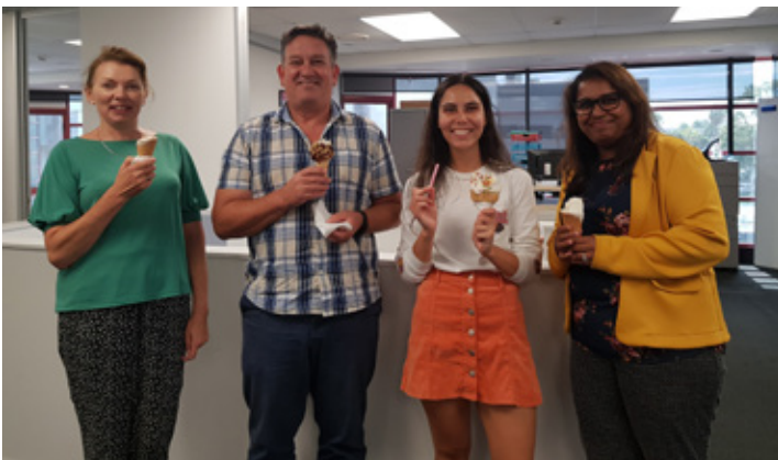
Our Team enjoying an Ice Cream from Mr Whippys!!